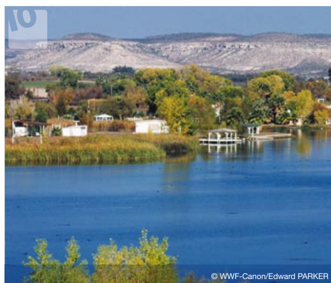
The Rio Conchos is the main source of irrigation water for crops (cotton & alfalfa) grown in the state of Chihuahua, Chihuahuan Desert, Mexico.

The Rio Grande basin is a globally important region for freshwater biodiversity (Revega et al. 2000). The Rio Grande supports 121 fish species, 69 of which are found nowhere else on the planet. There are three areas supporting endemic bird species as well as a very high level of mollusk diversity (Revenga et al. 1998; WRI 2003; Grommbridge & Jenkins 1998).