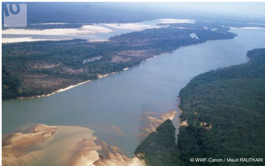
Aerial view of the Paraná River, Paraná, Brazil.

conducted collaborative research which led to a joint conservation strategy for over 1 million ha of contiguous Atlantic forest, and is an important step towards cooperative management of the region's Iguazu National Parks. Finally, WWF is seeking to develop representative protected areas in the Brazilian Pantanal, through the use of innovative incentives and policy mechanisms 34 , and plans to investigate a range of approaches to participatory involvement for local communities and government authorities.