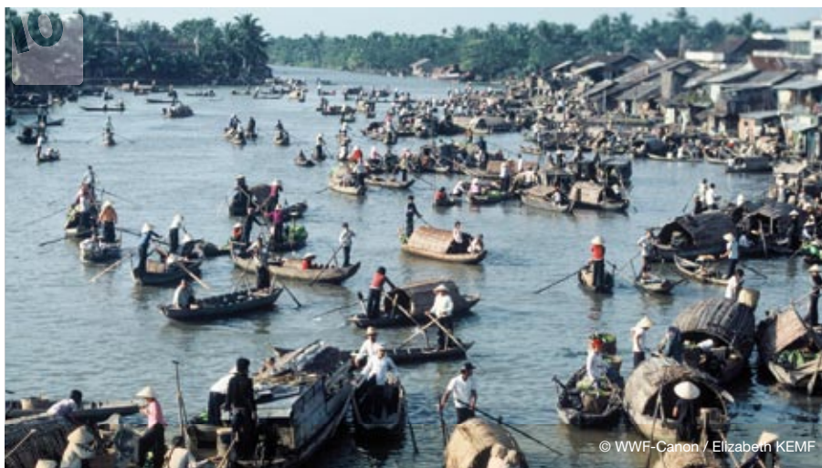
Sampans meet at early morning market in the Mekong delta. Vietnam.

In 1995, all basin countries except the two upper basin states, China and Myanmar, signed the Mekong Agreement and revitalized the Mekong River Commission 66 to promote cooperative management of the river (Water Policy International Limited 2001). Though the Commission has made progress in its relations with China and Myanmar in sharing information on fisheries and hydrological data, insufficient attention has been paid to halting overfishing throughout the basin. Areas threatened by overfishing need better institutional capacity to create and enforce legislation on fishing methods and rights. In addition, community-based fishing cooperatives, improved communication between stakeholders and integrated basin management are essential in protecting beneficial flooding and the Mekong River's resources.