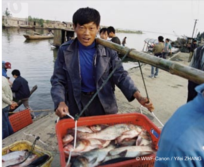
Fishing is a main livelihood on Zhangdu, site of consevation work supported by the WWF HSBC Yangtze Programme, Hubei Province, China.

In the past year, Chinese government authorities, with support from WWF, have taken steps toward developing an integrated basin management plan which would help stem the threat of pollution in the Yangtze. Integrated river basin management (IRBM) is vital to enable communities to restore the natural capacity of their watershed to 'treat' pollution. IRBM is a tool communities can use to balance development and conservation needs, such as whether to construct dams or diversions, which severely affect quality of water in a basin.